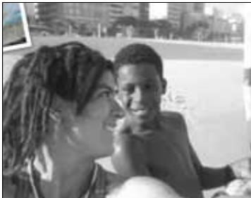
Lola playing with kids

The poem resist itself to the lack of words.