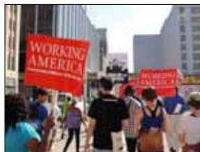
March in the street of Detroit