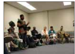
Workshop with African