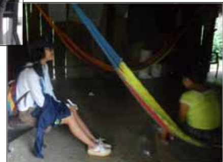
Yuri doing interview with people