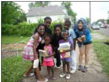
Enjoy face painting Jua with kids