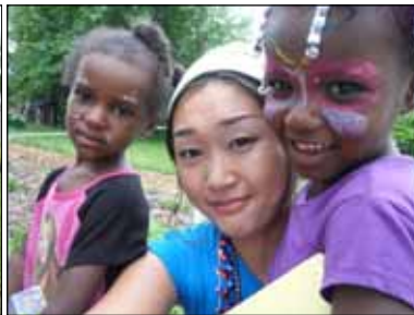
Enjoy face painting Sunny with kids