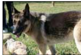
Our Guardian Milla

The most popular program was to make healthy drink. We made some cocktail with fruit and juice without alcohol. It